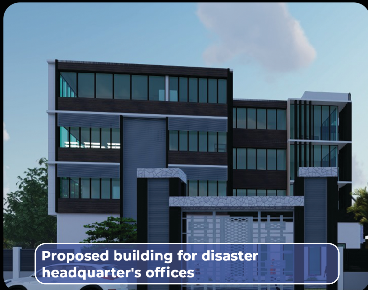
Proposed building for disaster headquarter's offices