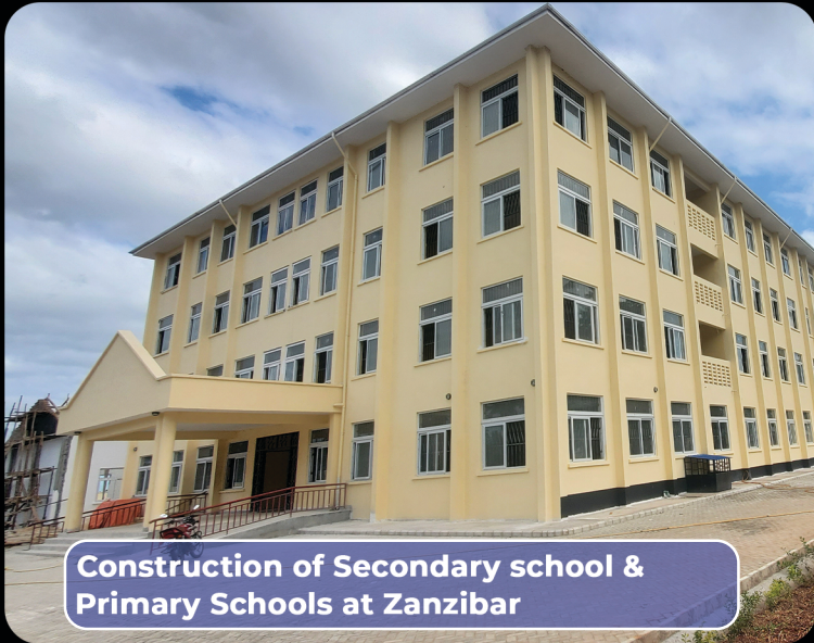
Construction of Secondary school & Primary Schools at Zanzibar