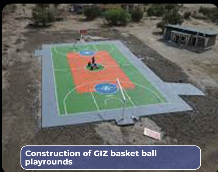
Construction of GIZ basket ball playgrounds