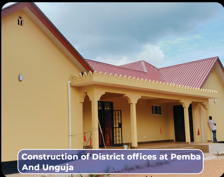
Construction of District offices at Pemba And Unguja