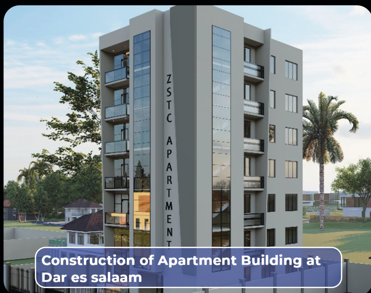
Construction of Apartment Building at Dar es salaam