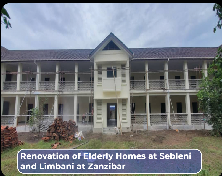
Renovation of Elderly Homes at Sebleni and Limbani at Zanzibar